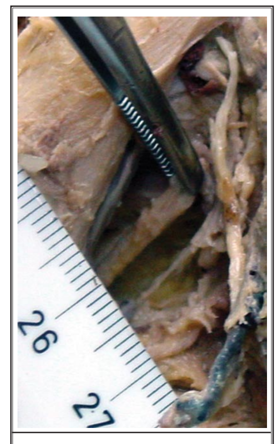
Fig 2. Suprascapular nerve in the suprascapular fossa held with tweezers at anatomic dissection; the unit of measure is a cm.