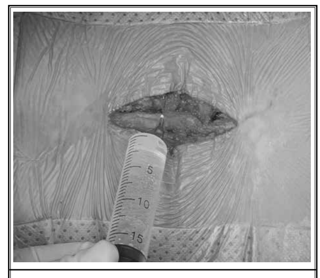
Fig. 2. Multi-drug was infiltrated into paraspinal muscles bilaterally and subcutaneous tissue under the incision before closure.

groups, preoperative and postoperative parameters, were determined by the independent sample t test. The chi-square test was performed to analyze the categorical variables. P < 0.05 was considered statistically significant. Statistical measures were performed using Statistical Package for Social Science version 25.0 (IBM Corporation, Armonk, NY).