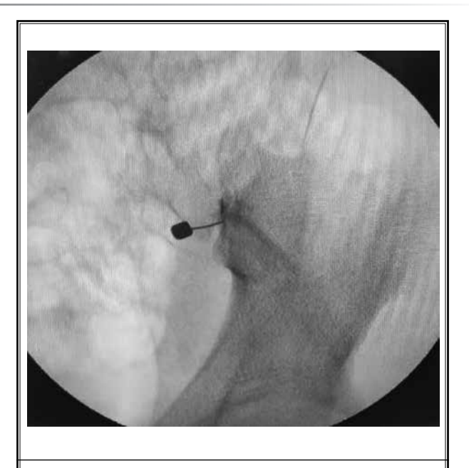
Fig. 2. Injection of SIJ. The patient was positioned supine and the needle was inserted into the SIJ space under the fluoroscopic guidance. Contrast was used to confirm the position of the needle, then a 2 mL mixture of betamathasone and lidocaine was injected in the space. SIJ, sacroiliac joint.

The iliac pronation test is performed with the patient in the standing position. The feet are separated in parallel, slightly narrower than the shoulder width, with the upper extremities hanging naturally. The examiner stands behind the patient with both thumbs over the posterior superior iliac spines (PSISs) without pressing