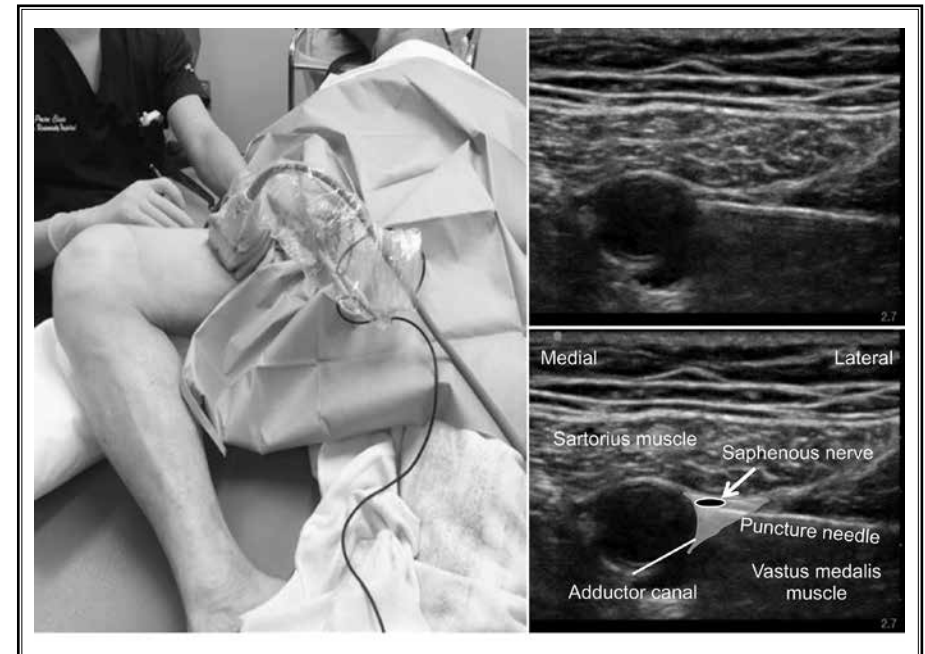
Fig. 1. Ultrasound-guided pulsed radiofrequency on the saphenous nerve: a) position of the ultrasound nerve and puncture site, and b) ultrasound images.

Patients, aged 40-85 years, with anteromedial knee pain were examined to ascertain their eligibility. After clinical and radiologic assessment, the study comprised patients with refractory knee pain of moderate intensity or greater for at least 3 months before the study (score of \geq 40 mm on a 0-100 mm visual analog scale [VAS]) and with a radiographic confirmation of a clinical diagnosis of tibiofemoral OA (Kellgren-Lawrence grades 2-4). In these patients, knee pain did not respond to conservative treatments, including oral analgesics, exercise, strength training, and intraarticular