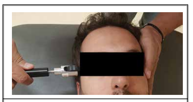
Fig. 1. Assessment of dynamic mechanical algometry over the temporalis muscle.

The sample size was calculated with an appropriate software