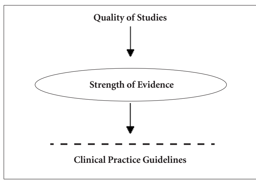
The dashed line is the theoretical dividing line between summarizing the scientific literature and developing a clinical practice guideline. Below the dashed line, guideline developers would decide whether the evidence represents all the relevant subsets of the populations (or settings, or types of clinicians) for whom the guideline is being developed. Adapted from Reference 73

evaluating all types of evidence based on the evidence-based principles. Practice guidelines are systematically developed to assist the practitioner and the patient in making decisions about healthcare. Prac-