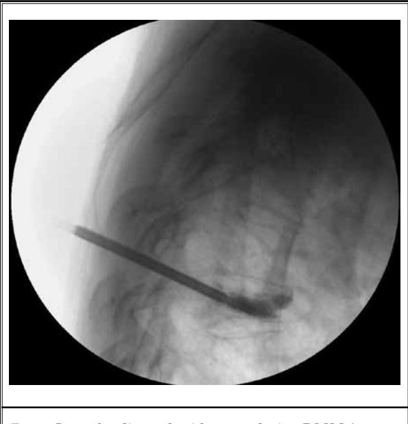
Fig. 2. Lateral radiograph with torcar, during PMMA injectate.