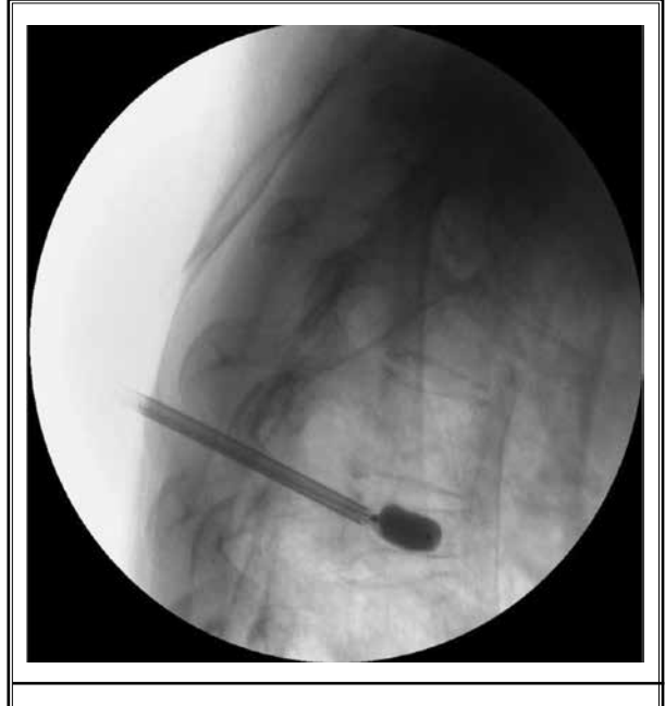
Fig. 1. Lateral radiograph during ballon inflation.