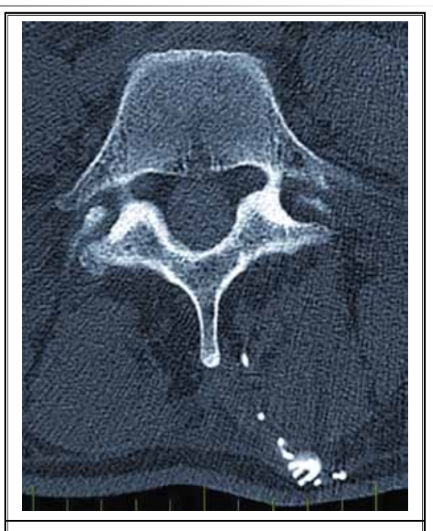
Fig. 2. Disconnection of the spinal catheter shown by CT scan with contrast liquid delivered by side port of the pump.

Baclofen withdrawal syndrome may begin immediately within the first 2 days, initially presenting with severe rebound of spasticity and pruritic symptoms as we observed in all of our patients. The main symptoms of baclofen withdrawal syndrome are sudden increase in spasticity, itching without any rash (pruritus), hyperthermia, headache, agitation, disorientation, hallucinations, autonomic dysregulation, epileptic seizures, coma, and rhabdomyolysis (Table 2). In severe cases the rhabdomyolysis with disseminated intravascular coagulation and multisystem organ failure can lead to death (13). These symptoms are likely due to a sudden removal of baclofen-mediated GABA-B inhibition of the central