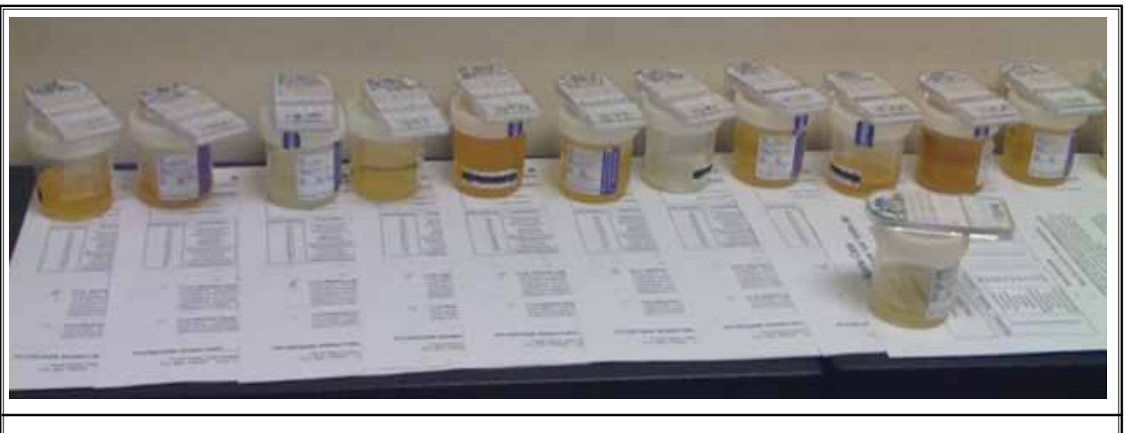
Fig. 1. Urine point of service testing.

Most normetabolites (such as norhydrocodone and noroxycodone) have longer elimination half-lives than the parent drugs, so that urine samples that test