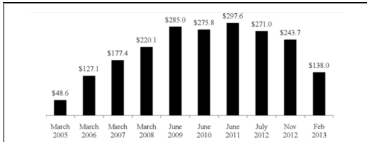
Fig. 2. Ten-year freeze estimate (in billions).

The House committee on Ways and Means and the Senate committee on Finance released the SGR repeal proposal in early November, and the 2 committees