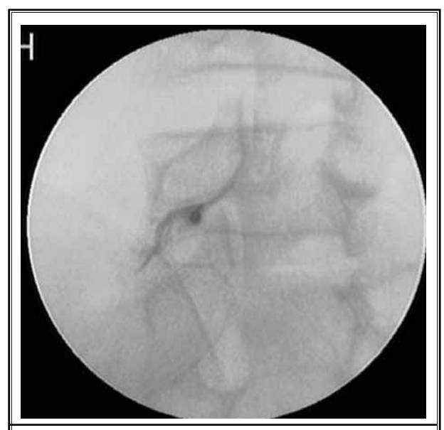
Fig. 1. Fluoroscopic oblique view after administering the left L5 transforaminal epidural steroid injection with contrast medium showing the L5 nerve root sleeve.

The clinical responses were evaluated and reviewed using a retrospective approach after obtaining approval of the Institutional Review Board (IRB). We identified 85 patients who received TFESI due to radiculopathy caused by FHLD or iHLD. There were 15 and 70 patients in the FHLD and iHLD groups, respectively. Before fluoroscopically guided TFESI was administered, all patients had undergone conservative treatments for at