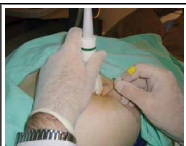
Fig. 2. US guided injection of the left PM. Physician's one hand holds the transducer while the other one moves the 22-gauge spinal needle into the PM.