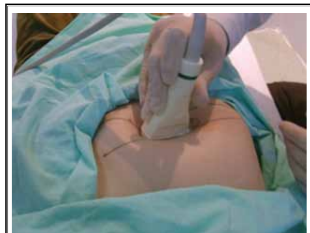
Fig. 1. Longitudinal placement of the US probe over the PM before the injection. Left PM is illustrated extending from the sacrum to the greater trochanter.

The expected values to calculate the sample size were 5 and 3, the standard deviations was assumed to be 2, and the power was determined to be 0.90 at an