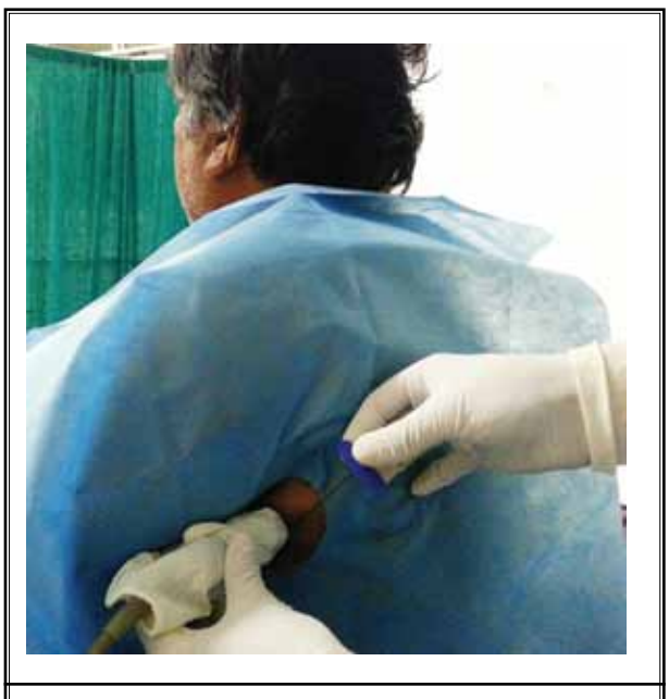
Fig. 1. Position of the patient and placement of the needle by inline needling technique.

The patient was placed in a sitting position with his left arm resting on a side table (Fig 1). An intravenous line was secured and all standard monitoring was applied. The procedure was performed with a 5-2 MHz curvilinear ultrasound probe (Sonosite M Turbo, Bothell, WA) under strict aseptic conditions. The serratus anterior muscle was localized over the 5th rib in a posterior axillary line in the vertical axis (Fig. 2A). Then the probe was aligned along the rib along the long axis of the rib. The needle entry point was anesthetized with 1% lidocaine. An 18 G Touhy needle was introduced under real time ultrasound using an in-line needle technique from a posterior to an anterocaudal direction. The needle tip was placed on the surface of the rib under the serratus anterior muscle between the posterior and mid-axillary line (Figure 2B). Hydro dissection was done with 3 mL saline to confirm the position of the needle tip. Thereafter, 20 mL of 0.125% bupivacaine was injected under ultrasound guidance. A 20 G epidural catheter was advanced through the epidural needle to a depth of 4 cm beyond the needle tip and tunneled subcutaneously to prevent dislodgement. The patient reported a significant decrease in