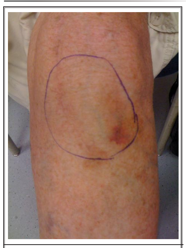
Fig. 1. The area of chronic knee pain following total knee replacement is demarcated.

The patient is a 68-year-old female with a past medical history of osteoarthritis who underwent partial left knee replacement in 2003. Due to persistent pain in the left knee joint, she underwent a total knee replacement in 2005. After her repeat operation, she continued to suffer from a deep burning and searing pain to the left knee located mostly inferior to her patella (Fig. 1). This pain occurred constantly and was made worse