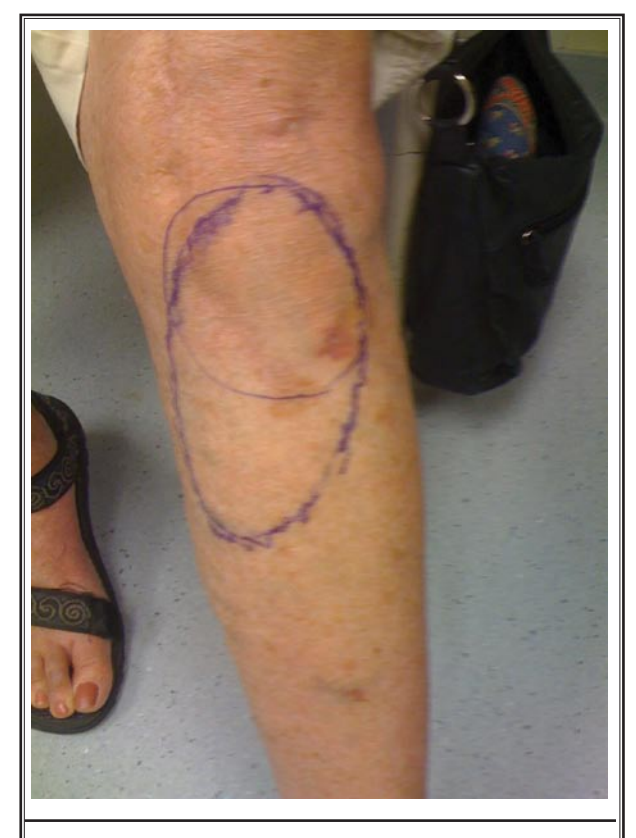
Fig. 3. Paresthesia overlying the painful area after spinal cord stimulator implantation is indicated by the thick oval outline. The thin circle represents the painful area (Fig.1).

with less discomfort and reported less pain with activities such as dancing following SCS implantation. The OKS performed 4 months and one year after permanent SCS implantations declined to 28 and 26 respectively. An OKS of 22 or less indicates satisfactory knee function without need for treatment (5). She continued to express satisfaction with her level of functioning and pain control one year after spinal cord stimulator implantation.