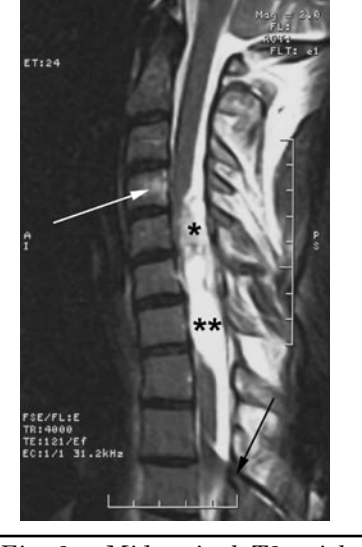
Fig. 2. Mid-sagittal T2-weighted FSE of the cervical spine: hyperintense lesion in the spinal canal, extending from the C4 to the T1 level; the upper portion of lesion is heterogeneous (*) and lower portion is homogeneous (**); high signal lesion in the C4 vertebral body (white arrow); leads with both high and low signal entering the upper thoracic epidural space (black arrow).

pain. We explained that a physician would be in the MRI suite with the patient at all times and would repeatedly query the patient about his ability to tolerate the study. The patient agreed to the MRI and signed a witnessed informed consent.